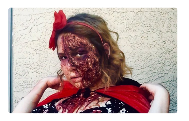
Oct 31, 2020

Read about this year's virtual Halloween costume contest in which two people entered and won in their categories. Article by @acripe2 #HappyHalloween2020